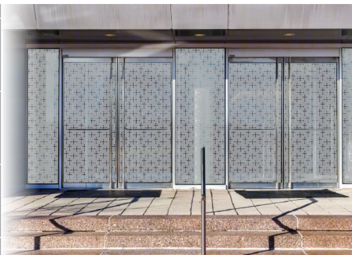
Jackstones | Frost 02.INV