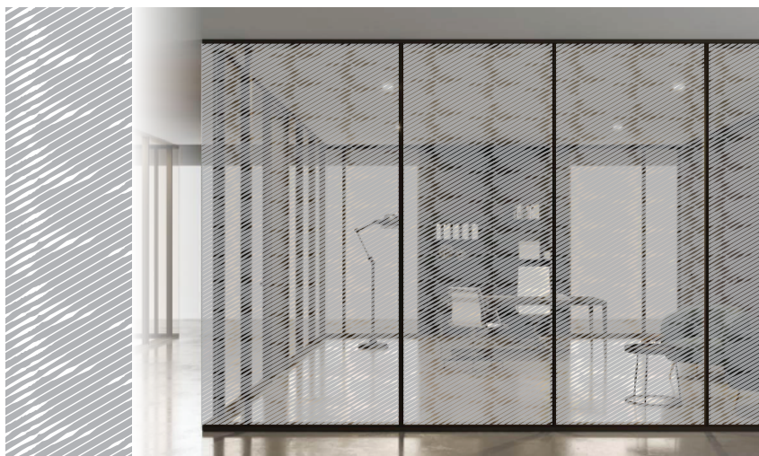
Lenticular | Frost 02.INV