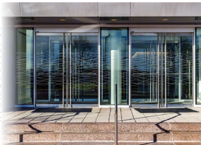
Oceans Wave | Frost 02.BND