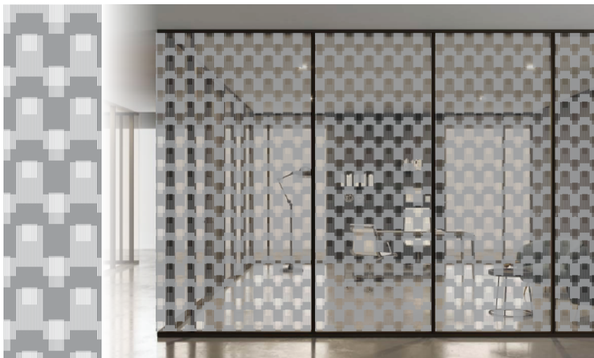
Processor | Frost 02.INV