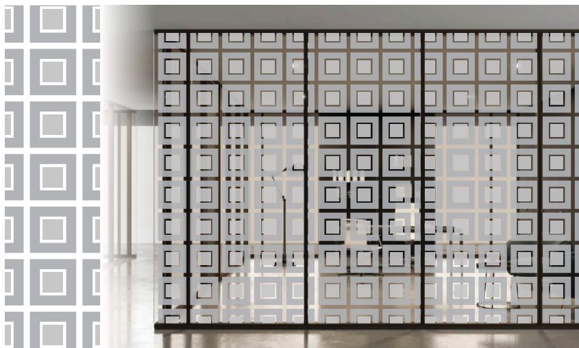
Squared | Frost 01.RG