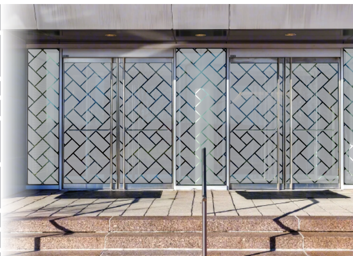
Basket Weave | Frost 02.INV