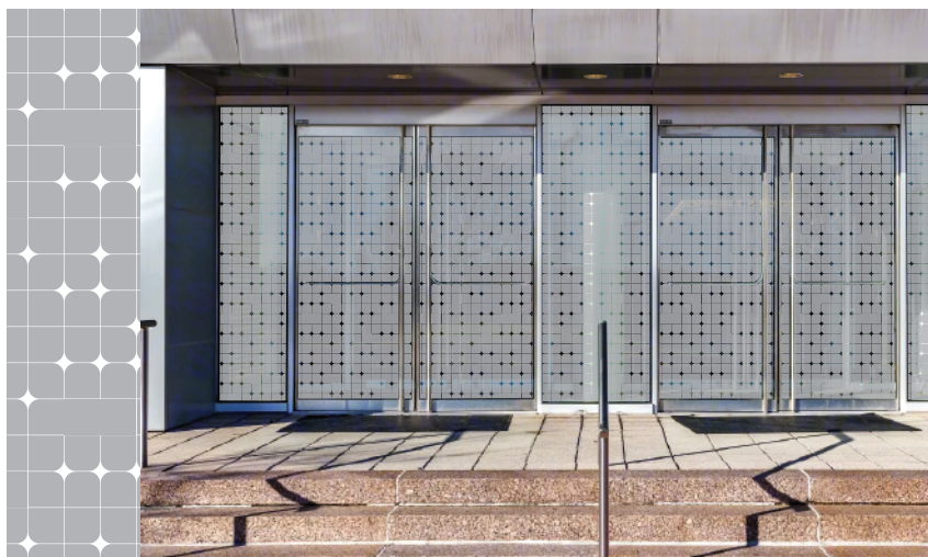
Celestial | Frost 02.INV