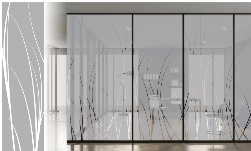
Eden Reed | Frost 02.INV