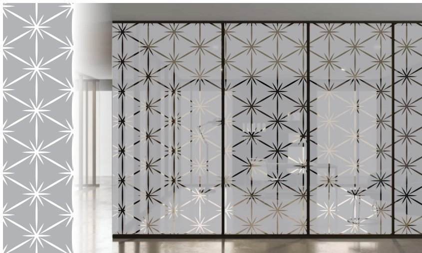
Starry | Frost 02.INV